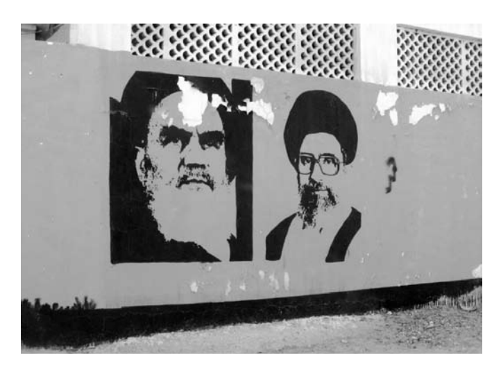
A painting of Shi'a Iranian leaders on a Bahraini village wall

Since gaining power, the Al Wefaq has called for the Minister at the centre of "Bandargate" to be brought before parliament. The ongoing nature of this scandal, and failure to reach a resolution, is increasingly undermining the credibility of the government on any issue of contention where trust and cooperation are needed. For Bahrain, this issue is all the more pressing given the various socio-economic challenges it faces and their ability to collectively undermine the economic reform project. Indeed, given its history of violent unrest, which was particularly unsettling in the late 1990s, the structural reforms that have been implemented so far are effective as a safety valve meant to lesson political tension. This was a luxury not available to the public during the riots that occurred in the twilight of Emir Isa bin Salman's reign. It is also an effective strategy of moderating opposition figures, as their participation in formal mechanisms of government effectively makes them stakeholders in the political system.<sup>44</sup>