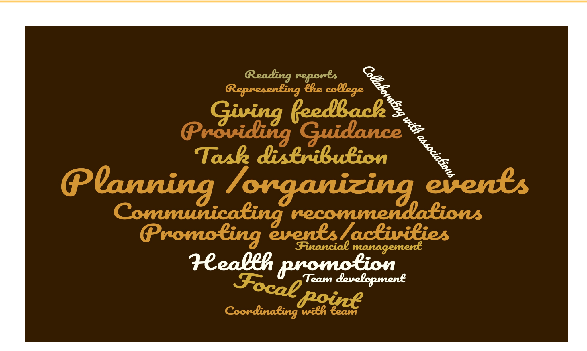
Figure 2 Word Cloud of Responsibilities Mentioned by Students with Current/Previous Leadership Positions at QU