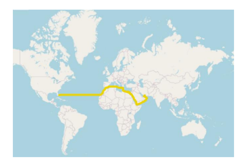
Figure 3 Distance between Jabal Ali and Freeport

According to the published feasibility study for Al-Shaheen filed, the enhanced oil recovery (EOR) surfactant used in the pilot project was manufactured in Freeport, TX,