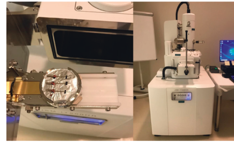
FIGURE 1: Laboratory setup for SEM images.

This investigation employed 60 NiTi files: 20 TN (26/0.04), 20 PTG F2 (25/0.08), and 20 ETP F2 (25/0.06). The files were divided into four equal subgroups ( n=5 ). An unsterilized group was assigned as a pre-autoclaving group (Cycle 0). The other three groups underwent various amounts of autoclave sterilization cycles (Cycles 1, 5, and 10). All files were removed from their packaging, and a code was blindly drawn for each file corresponding to the number of autoclaving cycles they were subjected to. At each cycle, a steam sterilizer (Steris Amsco Century Prevac Steam Sterilizerv 148H, OH, US) was used to sterilize the files for four minutes at 132°C under a pressure of 29 psi before being dried for five minutes.