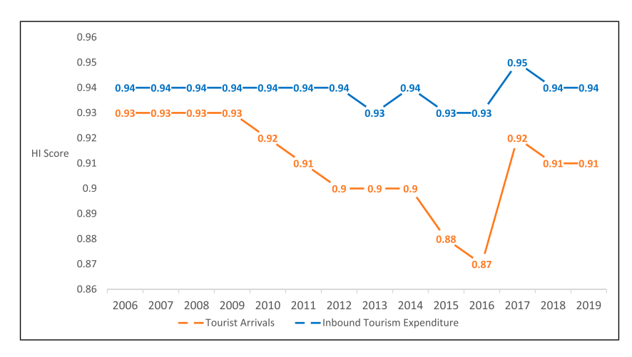
Figure 3. Herfindahl index (HI) score based on Qatar's tourist arrivals and international tourism expenditure between 2006 and 2019.