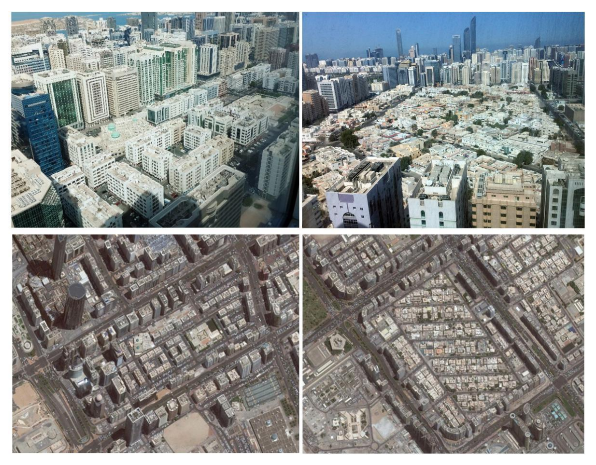
Fig. 2: Study Site 1 (left): High- and mid-rise typology; Study Site 2 (right): High-rise and low-rise typology