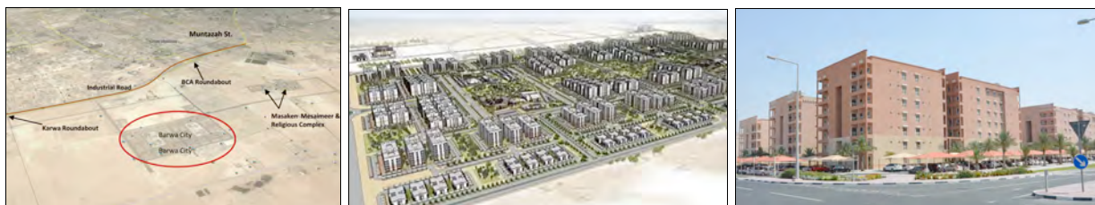
Figure 1-2-3. Map, Aerial view (drawing) and Street view of Barwa City, Doha, Qatar.

Real estate agencies highlighted the need and priority (1) to develop projects similar to the one called 'Barwa City' (see Figures 1, 2, 3, 4, and 5), and (2) to incentivize the private sector to build affordable housing (Sharif, 2013). The lack of affordable accommodation for middle income expats is a growing problem that some property companies have tried to address. In order to prevent overcrowding in districts and residential neighborhoods in Doha's center, the current tendency is to relocate medium-income groups from central areas to dormitory settlements in the outskirts and peripheries of the city (OBG, 2012).