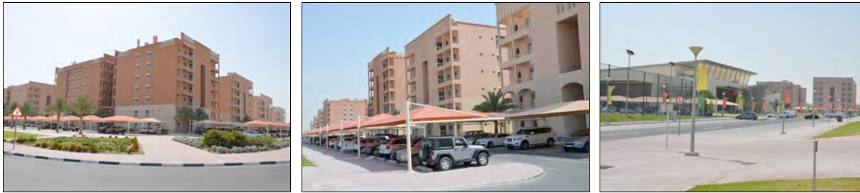
Figure 12-13-14. Absence of Mixed-use apartment blocks in Barwa city.