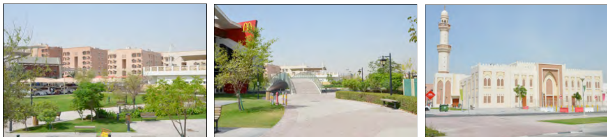
Figure 8-9-10. Open Public Realm and one of the Mosques in Barwa City.

In the case of Barwa city, the lesson from tradition cities inhabited by strong communities, characterized by the specific design of streets and squares encouraging a rich public life and where the built form and its relationship to the streets supports human interactions, is missed. There are no public places inside and around the residential buildings, due to the continuous prevalence of excessive areas for roads and car parks. The spaces to be used for social interaction and/ or activities act as detached and isolated buildings or areas not even connected by pedestrian or cycling paths to the residential buildings (see Figures 8, 9, 10, and 11). Traffic free public spaces around the building, where children can safely play without the constant supervision of parents, have been replaced by shaded car parks.