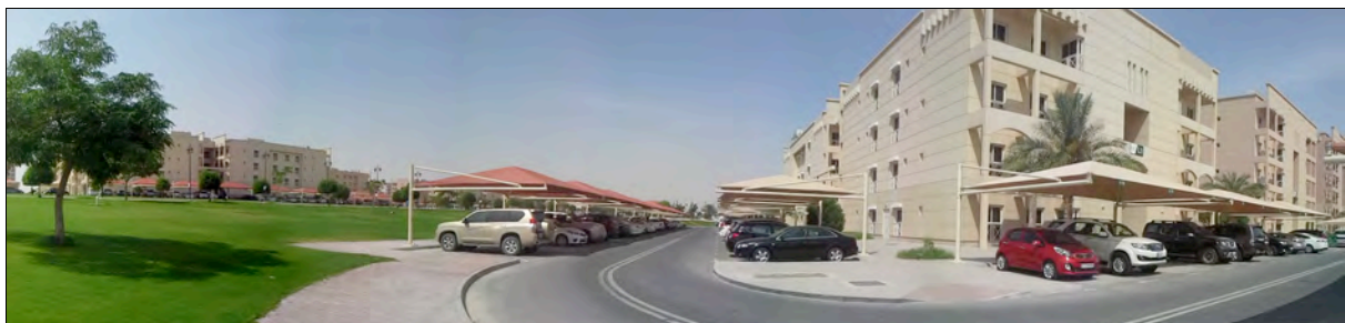
Figure 15. Panoramic view.

Both eastern and western planners have oversimplified the framework of the traditional Islamic city, providing a very rigid zoning model based on the golden rule of the separation of commercial and industrial areas from residential neighborhoods. In reality, large Islamic cities of the past, such as Cairo, Aleppo, and Damascus, have implemented exceptions to their built environment. During the Mamluk era in Al Cairo, the high population pressure and the complexity 'of new activities' semi-industrial produced the 'rab', a building-container, which houses retail-sales functions and craft workshops within the two lower floors, and apartments within the upper floors. The medieval 'rab' is a successful example of building, which comes from Cairo's secular transformation process and from the courthouse to its transformation into in late-Roman tower, to the subsequent aggregation of the towers in a row or around a large common courtyard - almost a closed square - square with the retail function within the lower floors. This brief typological tour provide an understanding of how poor and dull the alternatives offered by the contemporary city are, designed between the detached cottage and the tower and in opposition how much wealthy solutions are offered by local history when he puts at stake diversity of functions, orientation, linked with urban routes and housing distribution.