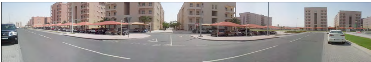
Figure 4. Panoramic View of Barwa City.

Governmental authorities, such as the Ministry of Municipality and Urban Planning (MMUP) and Ashghal-Public Works Authority, have also highlighted that the key factor for the long-term success for these developments is the understanding of the extent to which new transport systems are integrated within the urban fabric of Doha, how the land along transport systems is used with the aim to reduce traffic congestion.