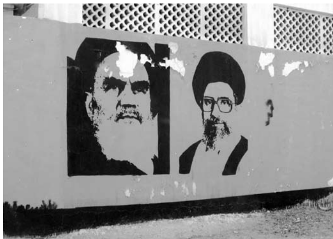
A painting of Shi'a Iranian leaders on a Bahraini village wall

Since gaining power, the Al Wefaq has called for the Minister at the centre of “Bandargate” to be brought before parliament. The ongoing nature of this scandal, and failure to reach a resolution, is increasingly undermining the credibility of the government on any issue of contention where trust and cooperation are needed. For Bahrain, this issue is all the more pressing given the various socio-economic challenges it faces and their ability to collectively undermine the economic reform project. Indeed, given its history of violent unrest, which was particularly unsettling in the late 1990s, the structural reforms that have been implemented so far are effective as a safety valve meant to lesson political tension. This was a luxury not available to the public during the riots that occurred in the twilight of Emir Isa bin Salman’s reign. It is also an effective strategy of moderating opposition figures, as their participation in formal mechanisms of government effectively makes them stakeholders in the political system. 44