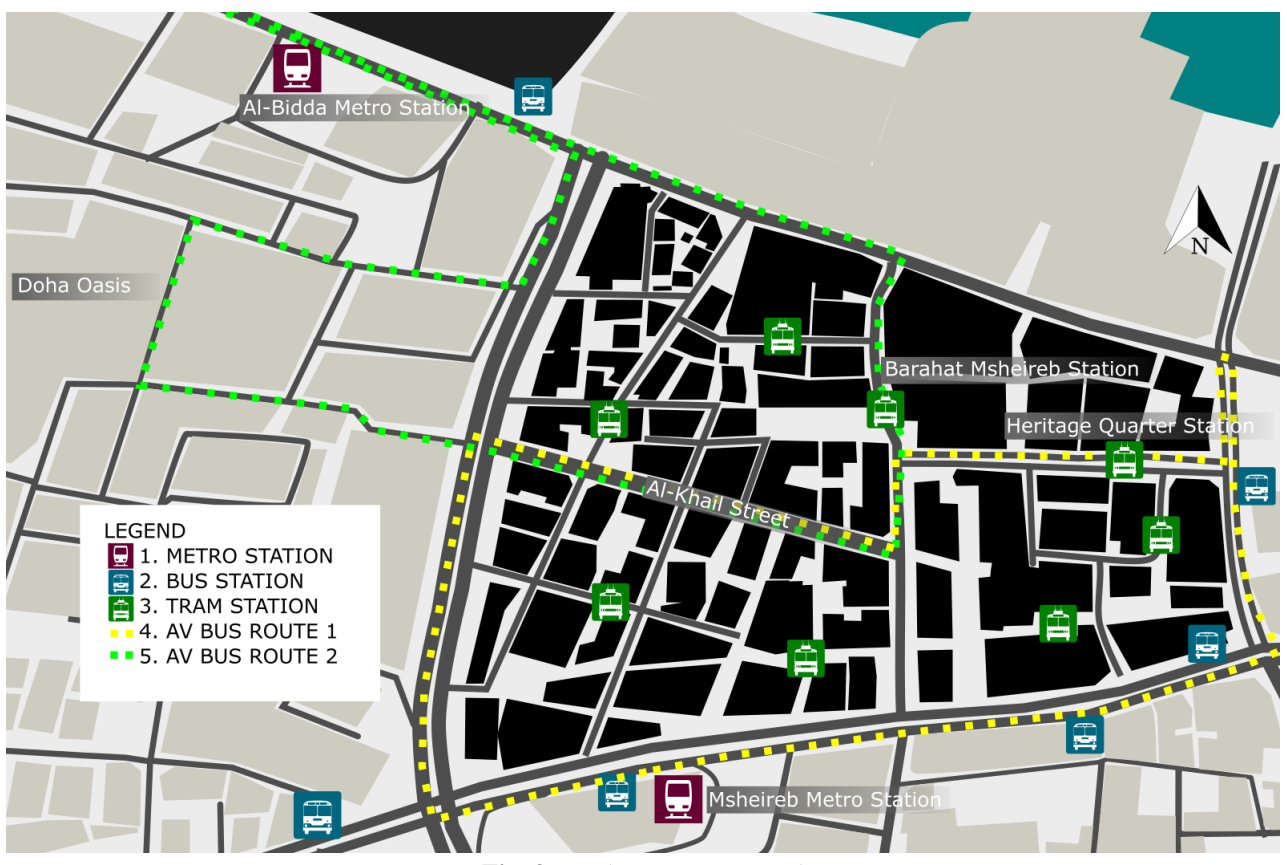
Fig. 3: AV bus route proposal

the bus network configuration, which radiates from the central core into many metro areas.