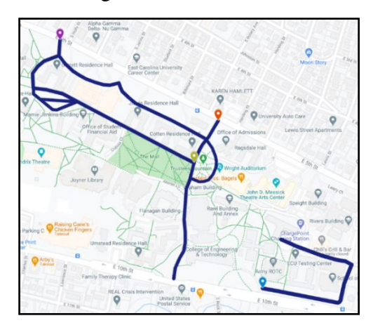
Fig. 1: Locations of Surveyed Streets with Pavement Distresses on ECU campus

processing. The aerial images were manually labeled and classified into two categories before inputting them into the model for training.