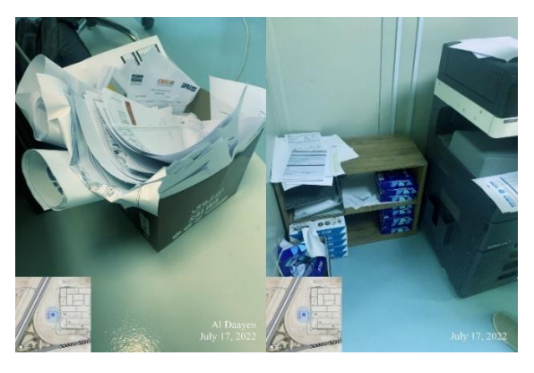
Fig. 1: Unused printed pages

Although a collaboration awareness session on the importance of keeping the environment safe and minimizing the usage of printed pages was held, the number is yet to be increased as shown in Figure 1.