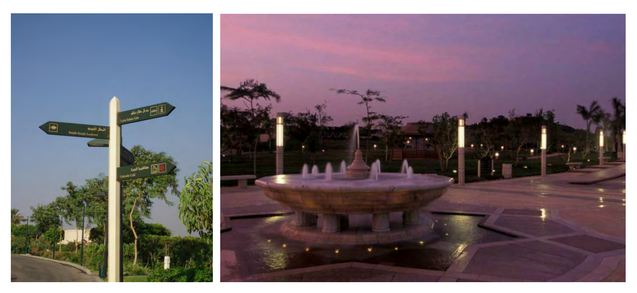
Figure 15. Signage system and sign design: was a major source of users' dissatisfaction

length of the Wadi. The branding' of the Wadi is achieved through elaborate signage including way-finding and interpretive signage and is enhanced by street lighting and trail lighting systems for the entire Wadi. The way that the vehicular circulation system has been designed and implemented, and the strict codes of conduct in the Wadi, both contribute to the family-friendly atmosphere in the Wadi. In addition, the signage system, with its well thought-out banners, educate and encourage people to act responsibly towards the environment of the Wadi, and contribute to giving them a sense of being actively involved, and an acute sense of ownership.