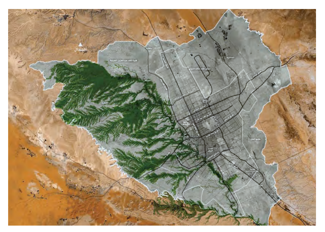
Figure 10.The Greater Riyadh Area and the Location of the Wadi Hanifa Watershed. (Source: Moriyama and Teshima Architects)

designs for the restoration of the Wadi from the Al-IIb Dam in the north to Al Hair in the south. The aims of the comprehensive plan involves a number of parameters that include a clean environment, accessibility, environmental quality, public landscape and cultural resources - in order to attract private investment for private-sector projects and private sector tourist investment.