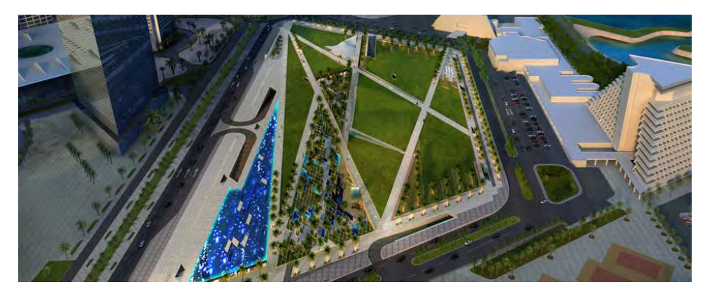
Figure 4. The New Sheraton Park (under construction)

The Sheraton Park: The Sheraton Park is the creation of a renewed public green space covering the area from the Doha Bay Corniche to the Sheraton Hotel, just across from the West Bay emerging business district and the Diplomatic Area nearby. The project - currently under construction - includes the design and creation of a public park, a two-story underground car park accommodating around 2,000 vehicles, in addition to a tunnel connection leading to the convention center being constructed adjacent to the Sheraton Park (Figure 4). The proposal also includes a maintenance-depot and a control center for Doha's future light-rail passenger transit system and two connecting entry-and-exit tunnels. According to the developers, Qatar Diar and DaVinci, The project consists of a 73,000 sq. m. public park of "exceptional quality," including basins, water fountains, children's playgrounds, cafes and restaurants (QDVC, 2013).