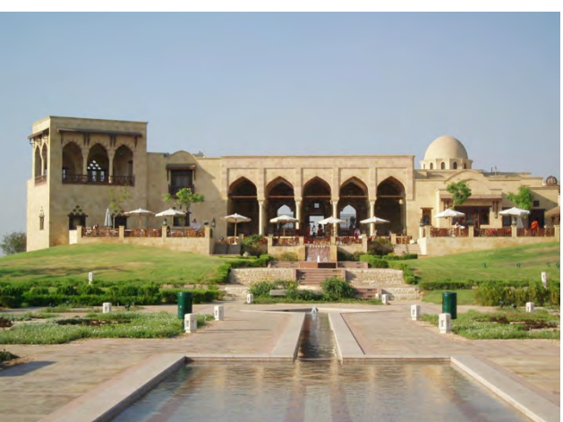
Figure 9. Hill Top Restaurant View