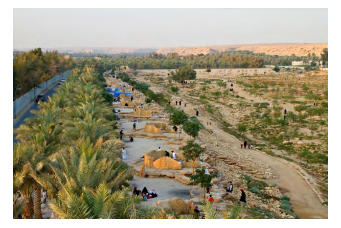
Figure 12. Interpretative trails that wind their way throughout the Wadi allowing the public to access the area easily and to direct them to places of interest

The implementation of the master plan was divided into two parts: The first is the Wadi Hanifa Restoration Project to restore flood performance and water quality, and to complete the restoration of the Wadi bed and the second is Wadi Hanifa Development Program, for the public infrastructure and public landscape capital construction works with associated private sector investment projects (Samhouri, 2010).