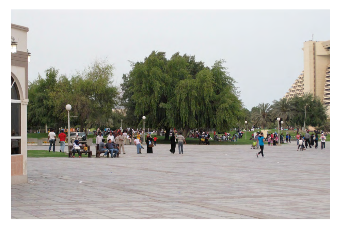
Figure 19. Individuals and groups congregate on pavements and green spaces at the mapped area

Many users also passed by the major sidewalk or pavement, which runs parallel to the promenade, the major pedestrian spine that links the whole waterfront space of the Corniche Waterfront Park. The major activities appeared to be walking or stopping to use the rental bikes available in the green space near the cafeteria. Families were observed searching for a pleasant shady spot under a big tree, particularly near the children's play area, a space which is dotted with small trees on landscaped artificial hills and hummocks. Casual observation at other times, apart from scheduled behavior mapping times, records that the space is more vibrant and more heavily populated during special events such as Qatar National Day celebrations and water sport events and competitions. While overall adults and children seem to enjoy spending their time there, pursuing their recreational interests and activities, the space lacks sufficient outdoor seating and significantly lacks parasols or other forms of shade, which could potentially make it more appealing for use by more groups, especially during the hot and sunny daytime hours.