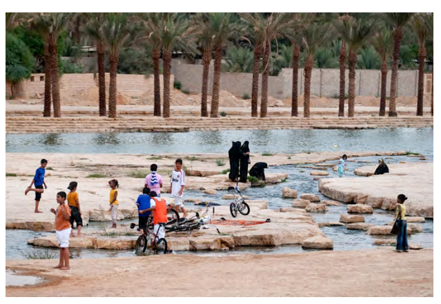
Figure 13. Public Space along the Wadi Hanifa. The parks are designed in a way that provides family compartments, in the form of semi-enclosed areas