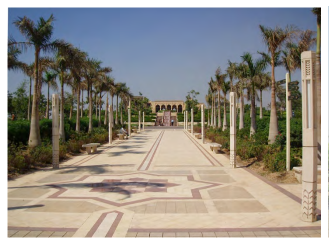
Figure 8. View of the Pedestrian Promenade showing the Hill Top Restaurant

At the macro level, the Al-Azhar Park's profile is totally treasured by the larger city. As shown from aerial photos, the uniquely greened Park is seen as a buffer zone separating the Darb Al Ahmar district, the famous historic sites, and the surrounding commercial districts. Through out history, Cairo has actively applied and implemented important civic projects. While environmental rehabilitation has just begun in many major cities worldwide, the Al-Azhar Park project along with the redevelopment of Darb Al Ahmar district is a clear step to continue this tradition.