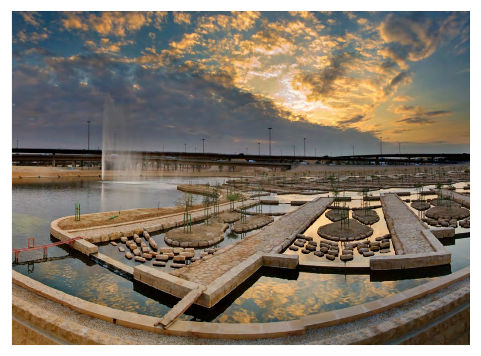
Figure 14. The Wadi Hanifa project successful in providing water treatment while creating a one-of-a-kind natural facility and open-space public attraction

In the city of Riyadh, the recreational facilities were combined with habitat enhancement and water quality infrastructure such as natural stone weirs to create a habitat for microorganisms and increase oxygen levels to reduce chloroform bacteria. The large bio-remediation facility is a one of a kind design, which recreates a complex habitat, in turn treating the city and river water naturally. Downstream large Periphyton Benthic Substrate Devices (APBS) have been installed, which have given way to an underwater habitat.