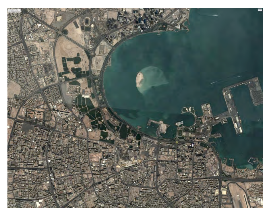
Figure 1. Aerial view of the city of Doha and the position of the Corniche

intensive phase of urbanization, that reacts to the global condition by introducing knowledge economy, cultural institutions, and state of the art building interventions. Between the historic city and the new West Bay towers, the landscape is punctuated with the narratives of the city's development, with the post-independence institutions buildings – such as the Emiri Diwan, the National Theater, and the General Post Office and other government buildings. The Corniche can be likened to a vast amphitheater that surrounds Doha Bay - like a moving stage that is crisscrossed by the passing Dhows, commercial tankers, cruise ships and pleasure boats. Extending for several kilometers along the Doha Bay, the Corniche is a linear landscape of movement, animated by the joggers, walkers, and cars along its streets and walkways (Figure 2).