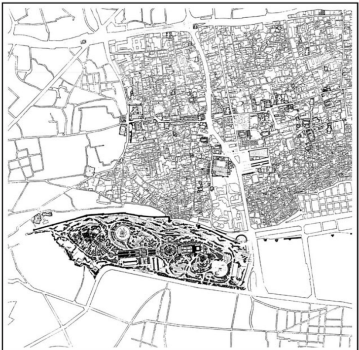
Figure 5. Aerial View of the Al-Azhar Park within the City of Cairo