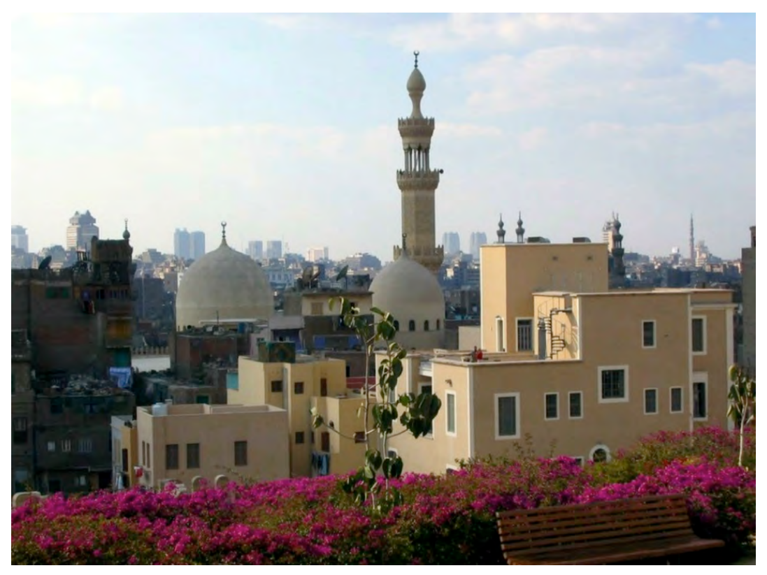
Figure 7. Al Darb Al Ahmar District

the project, intended to improve the overall condition of the surrounding districts. Cultural monuments and homes were renovated. After surveying the area's residents, a list of priorities as viewed by the residents was developed. These priorities included but were not limited to training programs, sanitation, housing rehabilitation and renovation, micro-finance, employment, and health care (Figure 7).