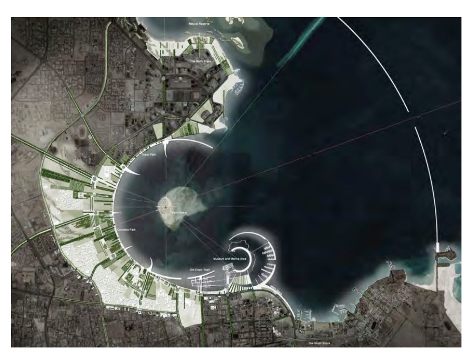
Figure 3. New Scheme for Doha Corniche by Kann Finch (Source: http://www.kannfinch.com/projects/corniche)

While projects are now being envisioned to extend the Corniche landscapes and cultural spaces, the discussion here is limited to the 7 kilometer crescent bay waterfront promenade, as well as the adjoining waterfront parks and public spaces. These include the Sheraton park, located at the northern extremity of the Corniche, connecting the waterfront promenade with West Bay and the new convention center, and the Museum of Islamic Arts Park marking the Southern tip of the arc. Both these parks are associated with major landmarks, the distinctive pyramid-shaped Sheraton Hotel, and the singular and insular Museum of Islamic Art, built on the water.