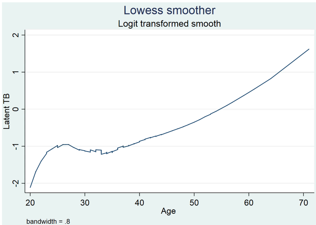
Figure 1 Lowess Curve Fitting of LTBI and Age