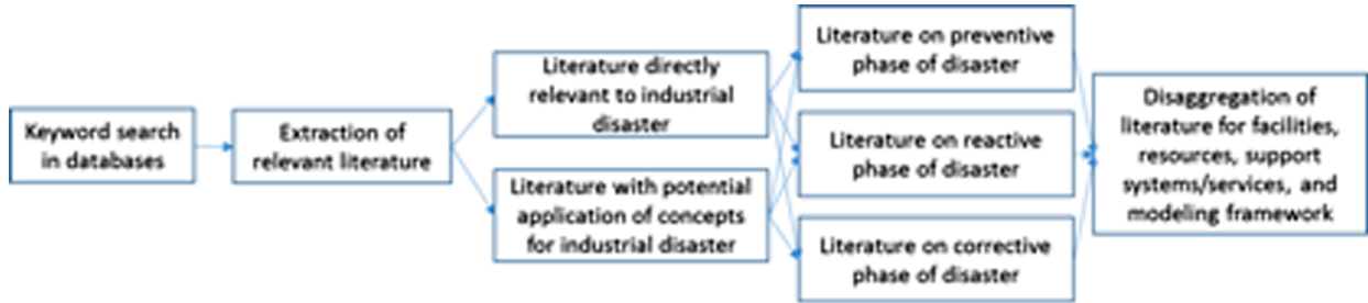
Figure 1. Methodology used for the literature review

Similar to the techniques used by Benet-Zepf et al. (2018) and Marin-Garcia and Martinez-Tomas (2016), the literature review methodology used in this paper uses a streamlined and systematic process as shown in Figure 1. The search started with the keyword search and then examining the literature for their relevance in industrial disaster.