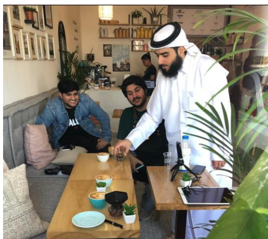
Figure 2. The researcher with two friends while filming the ratio video

The videos were uploaded in YouTube with limited access to those who got the link shared by the researcher, to insure that the video is only watched by the experimental group during the period of the research. After the post assessment completed, the videos were published to public and can be found via the following links: