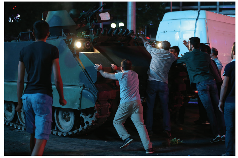
The Turkish public, attempts to stop the tanks of the putschists, in Kizilay Square Ankara, on the night of July 15.

creative individuals join together to resolve social contestation, at least, to the extent that it disrupts cohesion. So, a dynamic civilization is described as such since its socialization has nurtured a unique cadre of leadership that responds to difficult situations, offers solutions, imperatively upholds authority, and instructs apprenticeship in the dissemination of the dominant social imaginary. This is a describes a cycle whereby the social imaginary becomes more deeply habituated over time. The widespread embrace of that social imaginary is what propels this cadre into leadership.