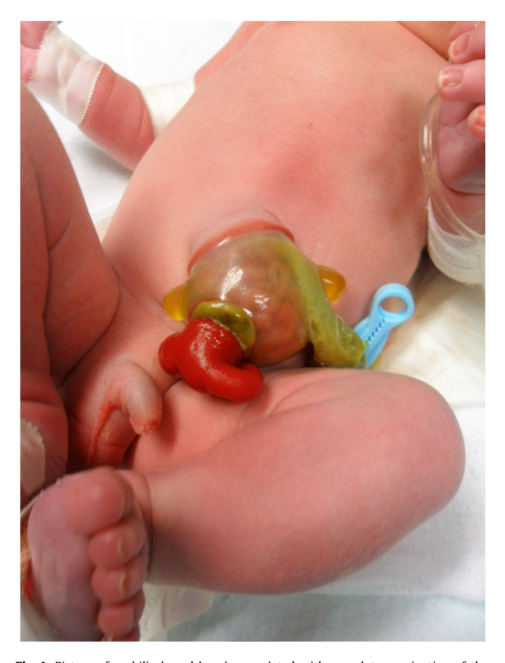
Fig. 1. Picture of umbilical cord hernia associated with complete evagination of the patent omphalomesenteric duct and prolapse of adjacent ileal limbs.

This case is unique in that it demonstrates the coexistence of MH and UCH. We believe this is the first well-documented report of these co-existent anomalies. Prolapse of adjacent ileal limbs through a POMD was another remarkable feature of this case.