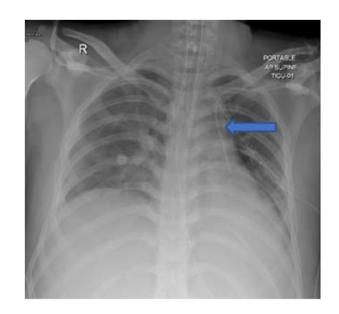
Figure 1b. Portable chest radiograph showing a central line inserted in the left subclavian vein, with the catheter located in a left para-mediastinal position.