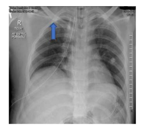
Figure 1a. Portable chest radiograph showing a central line inserted in the right subclavian vein (blue arrow) with final position in the (normal right-sided) SVC.

The initial admission CT scan of the chest done (including 3D reconstructions) were then re-reviewed, focusing on the upper thoracic venous anatomy, and it revealed the presence of a double SVC, with the left CVC in a persistent left SVC (Figures 2,3).