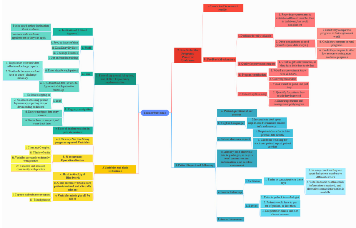
Figure 2 Emerged themes/subthemes.

post programme was suggested (eg, blood glucose, ID6). All of these suggestions were implemented.