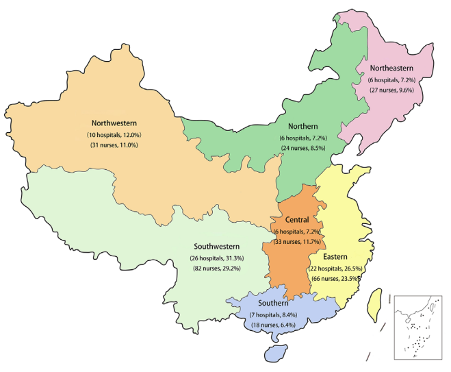
Figure 1 Regional distribution of the 83 hospitals and 281 nurses that were surveyed

Statistical analysis was performed using the dedicated SPSS V.23.0 software. For descriptive statistics, data were expressed as frequency, proportions and percentages for binary variables (ie, sex), and mean and SD for continuous variables (ie, score). The inferential statistics for the two groups included the \chi^2 test for categorical variables and the independent samples t-test for continuous variables. One-way analysis of variance was used to compare the continuous variables in three or more groups. Then a multiple linear regression method was employed to analyse the factors affecting the CGM management