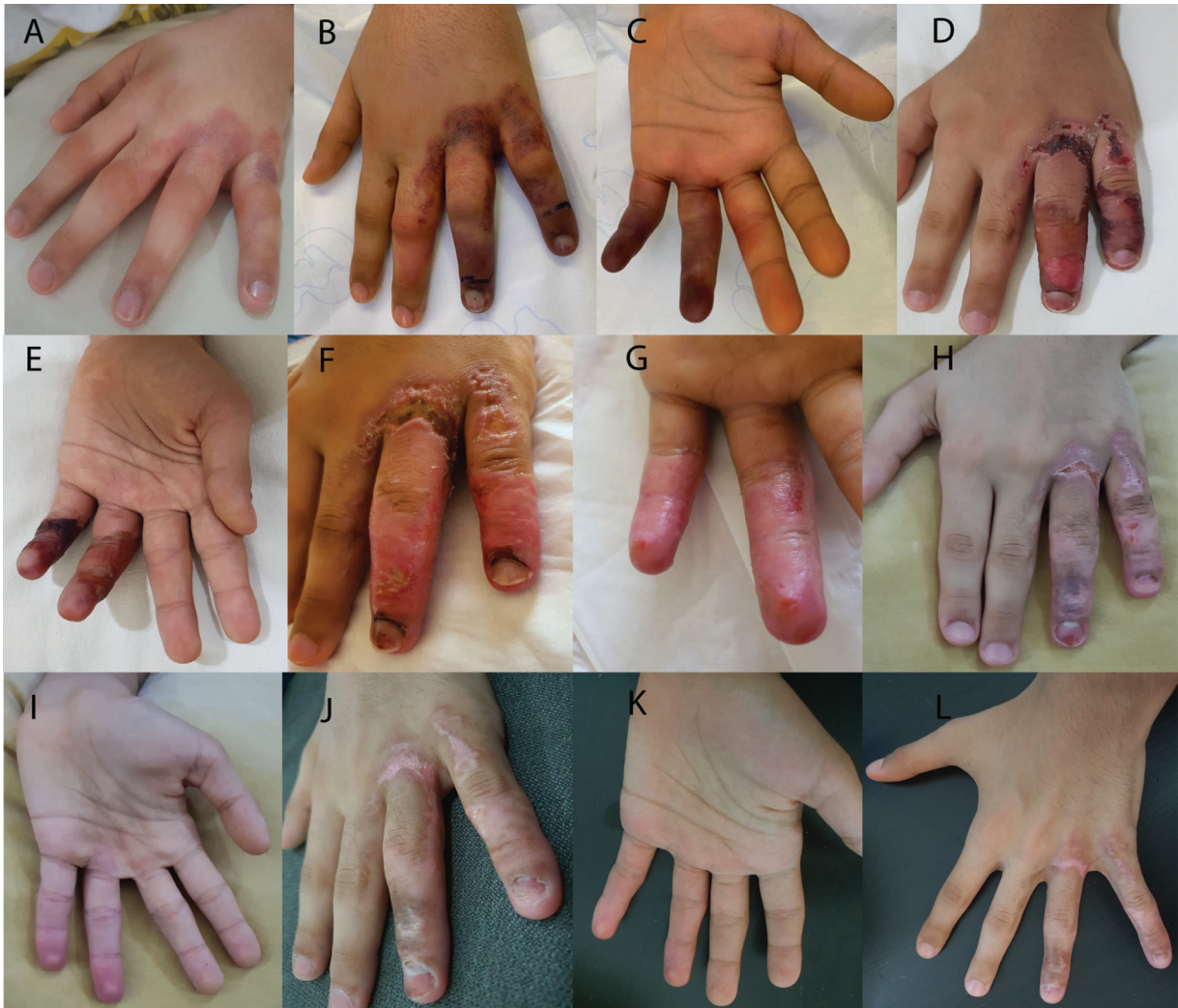
Figure 1. Digital ischemic changes over time following envenomation by an unidentified species of marine cnidarian. (A) Day 1. (B, C) Day 5. (D, E) Day 15. (F, G) Day 18. (H, I) Day 28. (J) Day 37. (K, L) Day 49.