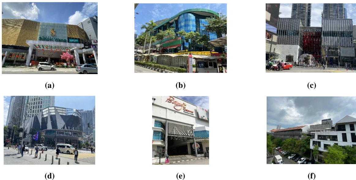
Fig. 1: The shopping malls constructed from the year 1970 to 2020, which are (a) Sungei wang Plaza, (b) Lot 10 Shopping Complex, (c) Pavilion, (d) Starhill Gallery, (e) Bangi Gateway, and (f) Tamarind Square