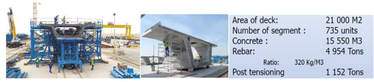
Fig. 4: Precast Concrete Segment Fabrication in VSL Yard 50 kms. south of Doha