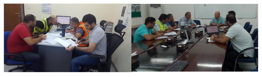
Fig. 8: Commitment meeting of Section, Construction and Project Managers

Target Value Delivery (TVD) is a management practice that drives the design and construction to deliver customer values within project constraints (Bollard, 2009 and Do, 2022). The goal of TVD is to address Cost Reliability Value Delivery and Continuous Improvement of the projects (Do, 2022).