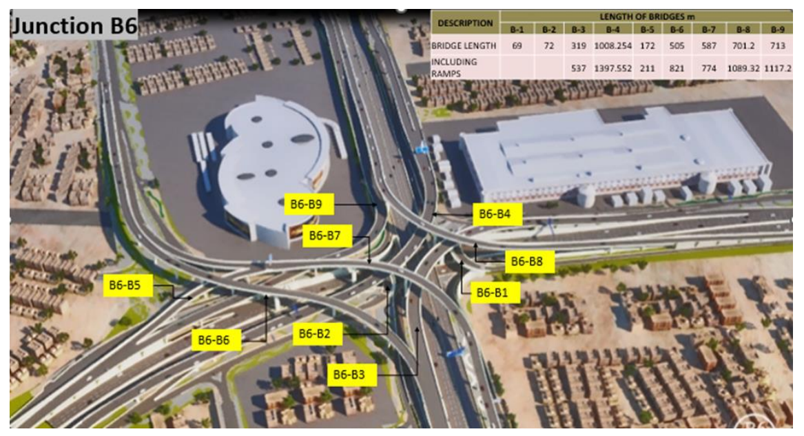
Fig. 2: Junction B6 (Landmark) with all Flyover Bridges

Junction B6 Interchange consists of nine flyover bridges, B6-B1 and B6-B2 bridges at grade level, B6-B3, B6-B4, B6-B5 and B6-B9 bridges at level +1, B6-B6, B6-B7 and B6-B8 bridges at level +2. The span arrangements for bridges varies from 36.0m to 90.0m, consisting of simple and continuous superstructure of precast segmental and cast in-situ box girder. The bridge section depths are varying from 2.0 m to 4.5 m. There are in principle two bridge deck widths, wide deck for level +1 and narrow deck for level +2. Figure 2 below shows all flyover bridges of Junction B6.