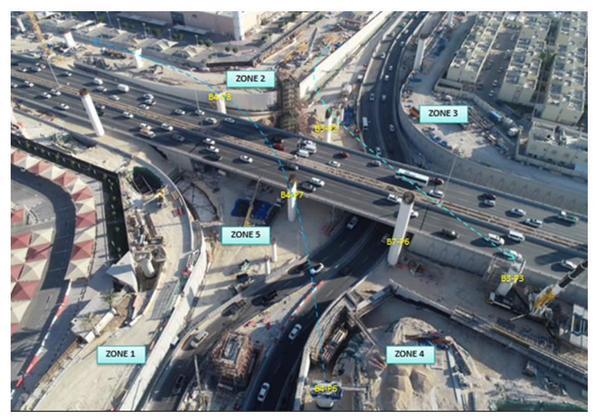
Fig. 3: Landmark Interchange during the Substructure Construction