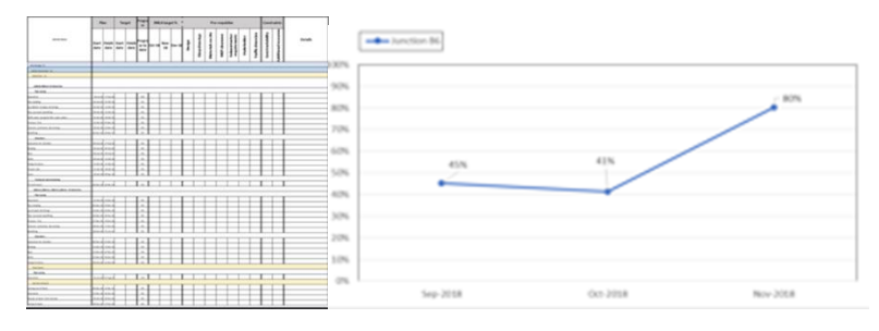
Fig. 9: Commitment to plan Work Sheet & KPI reliability CR%