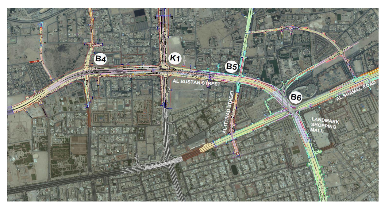
Fig. 1: Location map for Al-Bustan Street North Project

Al-Bustan Street North starts from Al-Luqta roundabout and ends at the Landmark Mall, it includes a section of Al-Ittihad Street and Al-Ittihad bridge connecting Al-Gharafa with Khalifa City North, the scope of works of the project comprises the design and construction of 4 main Junctions with 4 lanes in each direction, including the largest 4 levels interchange in Doha, which have 9 flyover bridges with 11 km in total length (Junction B6), one left turn bridge connecting the project with Al-Ittihad Street (Junction B5), one Cut and Cover Tunnel (Junction K1), and one Viaduct of two twin Bridges (Junction B4), in addition to the micro tunnelling, signs, utilities, retaining walls, pedestrian bridges, pedestrian/cycle paths, traffic signals, gantry signs, landscaping works and street lighting. The location map of Al-Bustan Street North Project is shown in Figure 1 below.