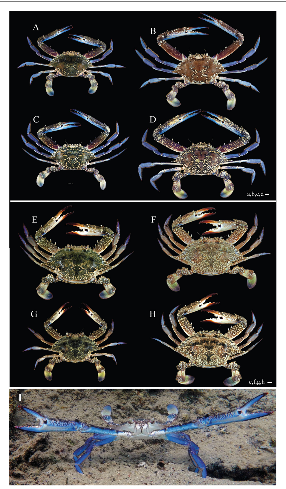
Figure 3 Portunus segnis of western Arabian Gulf. (A–D) males, (E–H) females. Scale 1 cm (a–h). (I) Portunus segins in situ with aposematic position and colour, highlighting the eyespot (ocelli) in the palm of the chelas.

described in references; however the population adaptation required for the extreme environmental conditions may be driving a speciation or a differing meta-population adapted