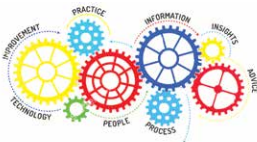
Figure-1: Knowledge Management Arena (Royalty Image)