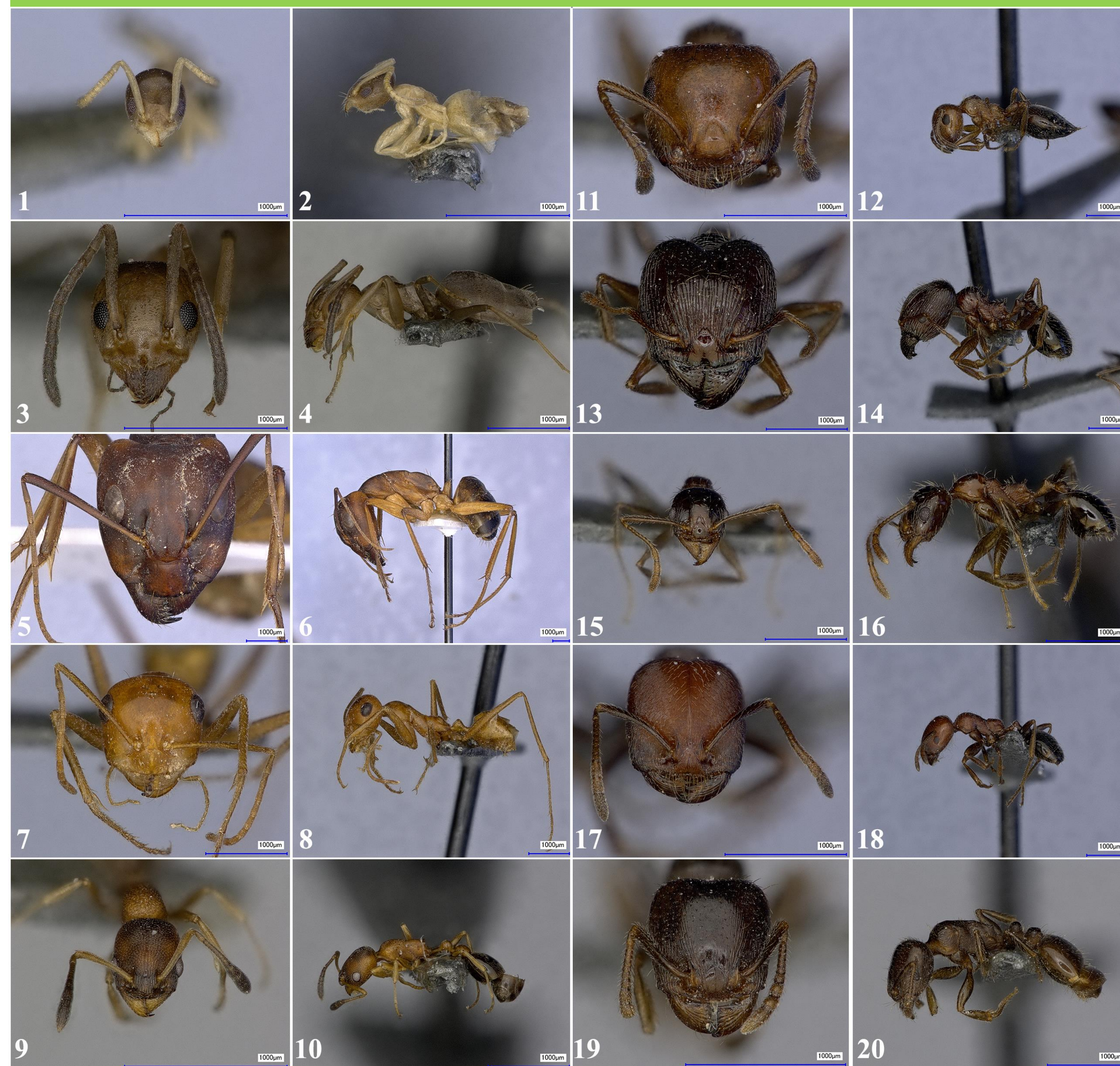
Figure 2. Representative of newly recorded species from Qatar. 1,2 Tapinoma melanocephalum Fabricius, (1) head in full view. (2) body in profile. 3,4 Tapinoma simrothi Krausse, (3) head in full view. (4) body in profile. 5,6 Camponotus thoracicus Fabricius, (5) head in full view. (6) body in profile. 7,8 Cataglyphis livida André, (7) head in full view. (8) body in profile. 9,10 Cardiocondyla emeryi Forel, (9) head in full view. (10) body in profile. 11,12 Crematogaster antaris Forel, (11) head in full view. (12) body in profile. 13,14 Pheidole indica Mayr, major worker (13) head in full view. (14) body in profile. 15,16 Pheidole indica Mayr, minor worker (15) head in full view. (16) body in profile. 17,18 Trichomyrmex lameerei Forel, (17) head in full view. (18) body in profile. 19, 20 Tetramorium sp. Mayr, (19) head in full view. (20) body in profile.