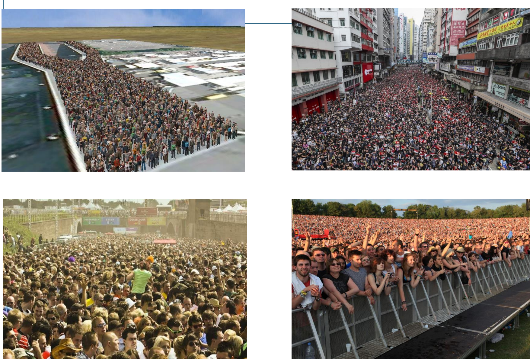
Figure 1. Examples of mas gatherings

In order to analyze the crowd, many tasks are tackled in the estimation of the density of the crowd by counting the number of people in the scene [4]. Using deep neural networks, many researchers also attempt to recognize the people behaviors to detect if there are any abnormal activities.