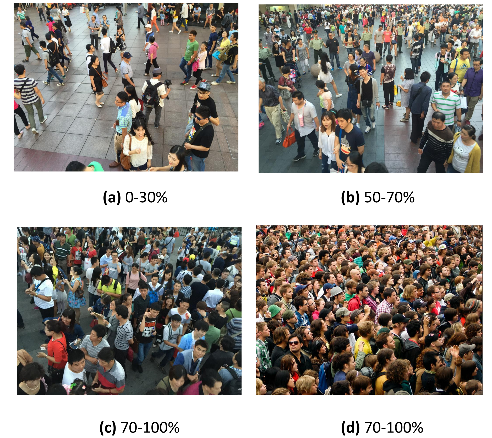
Figure 3. Deep density estimation Results

Using surveillance cameras at each Gate, as well as a Panel for illustrating the percentage can be a best solution. Also, the night vision infrared camera can be used instead of day-vision cameras.