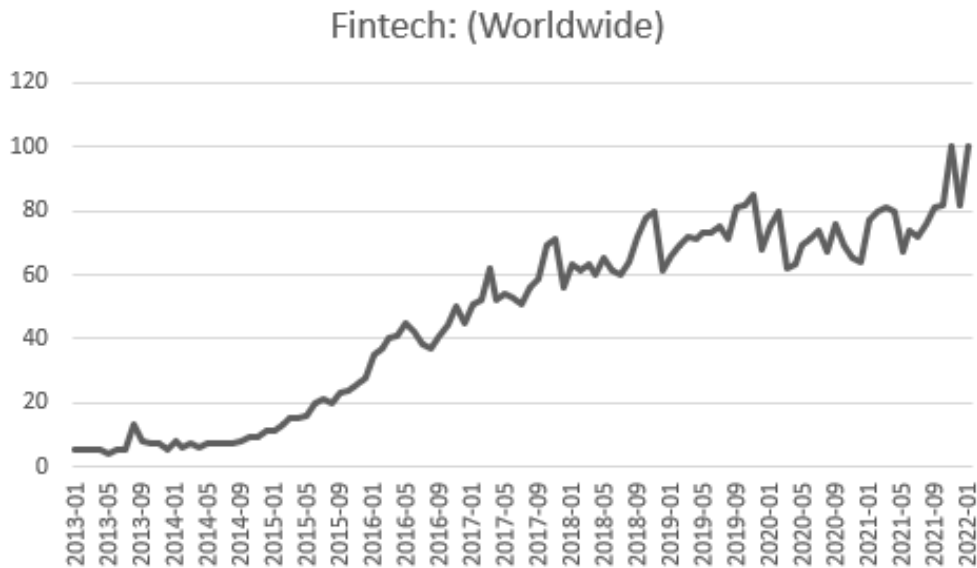
Figure 1. Popularity of the Word Fintech

"financial services," which has about 40,500 counts worldwide every month (Shueffel, 2016).