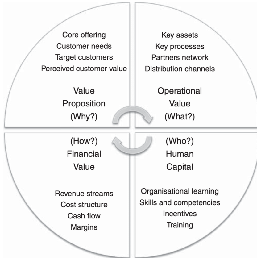
Figure 3. Business Model Innovation (Ramdani.et.al, 2019)

Each component of the BMI will be briefly discussed below based on (Ramdani.et.al, 2019) research.