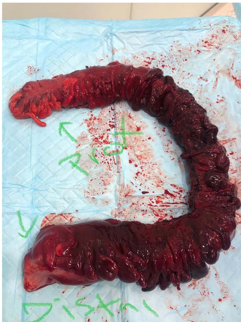
Figure 2. The full excised specimen from the exploratory laparotomy with left hemi and sigmoid colectomy, and transverse colectomy showing the proximal (transverse colon) and the distal (upper rectum) parts.

Superior Mesenteric Vein (SMV) thrombosis and bilateral kidneys wedge-shaped cortical hypodensities (mainly suggest ischemic insult) (Fig. 1).