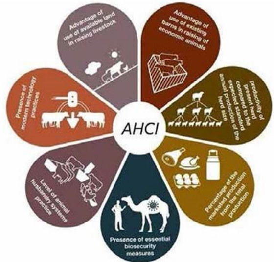
Animal Holding Classification Index - AHCI