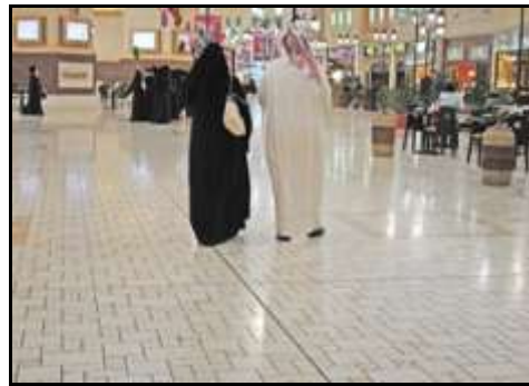
Figure 4. Illustrates Qatari wearing traditional attire; woman wear abaya and men wear thub and kutra

shopping supermalls (see figure 4). This was observed for young and old alike. Occasionally, alternative attire was observed; for example, some young male Qataris arrived at the Villaggio wore western-styled pants, and it is widely understood in Qatar that many women who consume these fashions display them beneath customary abayas . In fashion, in particular, there is strong evidence of the ways that tradition and a cosmopolitan rendition of modernity have blended in contemporary Qatar.