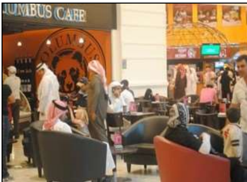
Figure 3. Qatari families socializing in a coffee shops in Villaggio supermall

forms of the project's data revealed these locations' frequent use by Qatari family units of various configuration (see figure 3). In the broader context of Qatari tradition and the persevering social norms, Villaggio and other shopping supermall's restaurants and coffee shops have allowed Qatari men and women to interact and spend time together in public space. In this sense, these commercial spaces in the quasi-public space of Villaggio provide a liminal zone whereby Qatari men and women are free of the shame, embarrassment, and critical glances that would accompany such social behaviors in Qatar's previous eras.