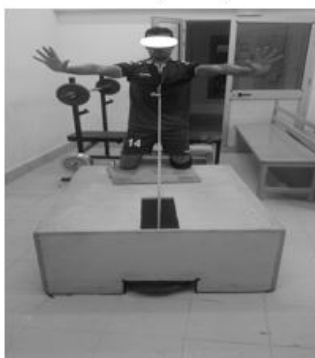
D. Starting position of plyometric wide arm push-up