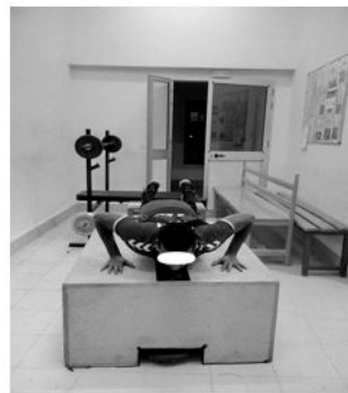
B. Reception phase of plyometric standard push-up