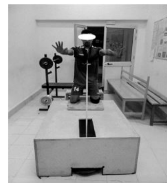
C. Final position of plyometric standard push-up