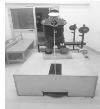
C. Final position of plyometric diamond push-up