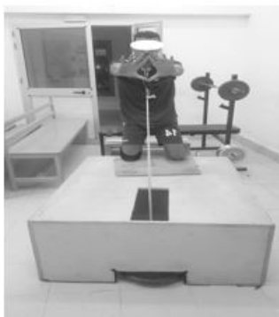
A. Starting position of plyometric diamond push-up