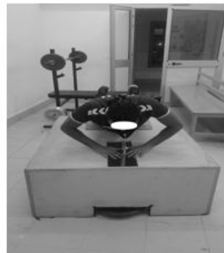
B. Reception phase of plyometric diamond push-up