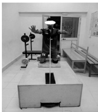
A. Starting position of plyometric standard push-up