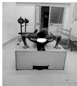
E. Reception phase of plyometric wide arm push-up