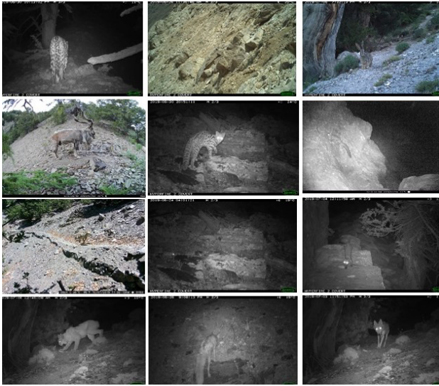
Fig. 2. Camera trap photographs of different mammals from the study area.