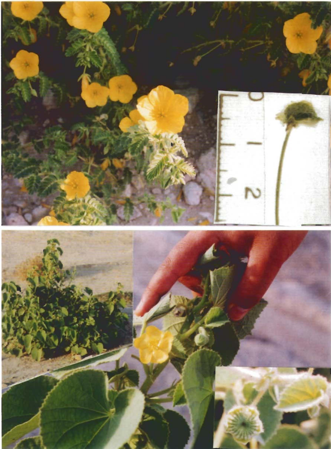
Plate 2. a. Tribulus cistoides , b. Abutilon figarianum .