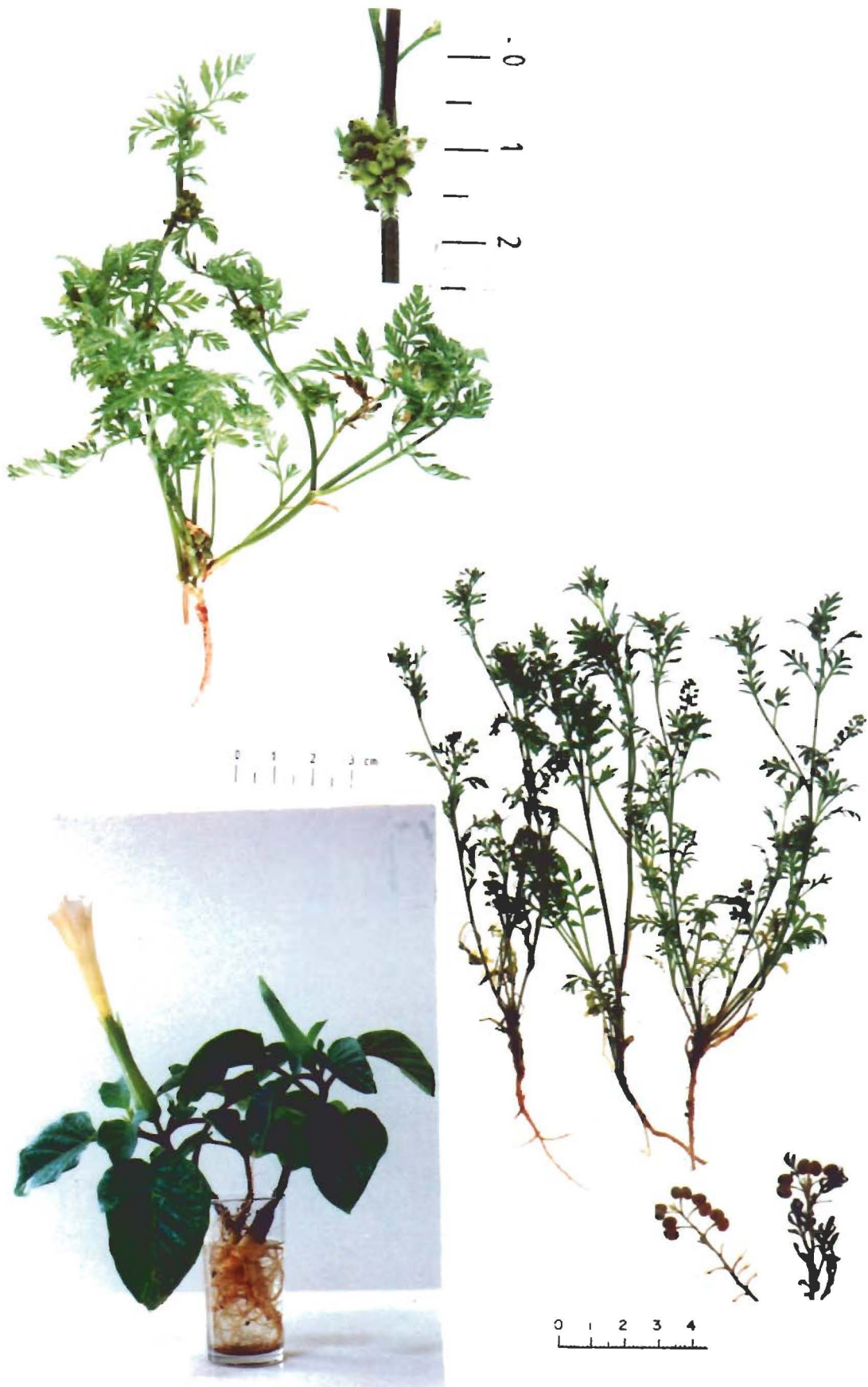
Plate 6. a. Torilis nodosa , b. Datura innoxia , c. Coronopus didymus .