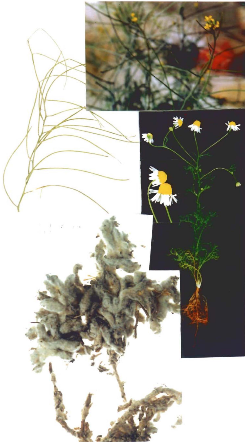
Plate 3. a. Sisymbrium orientale , b. P. gnaphalodes , c. Matricaria chamomilla .