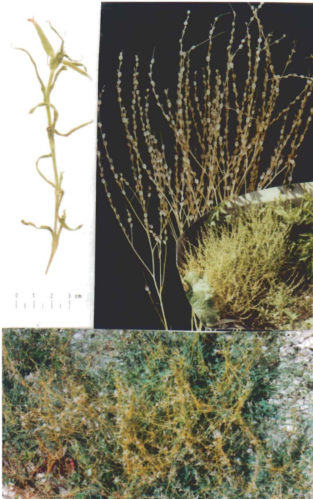
Plate 5. a. Silene conica , b. Lepidium sativum , c. Cuscuta pentagona .