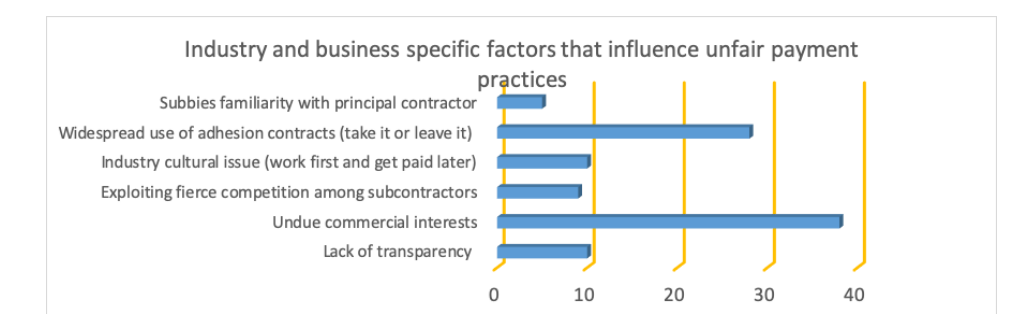
Figure 2: Industry and business specific factors that influences unfair payment practices