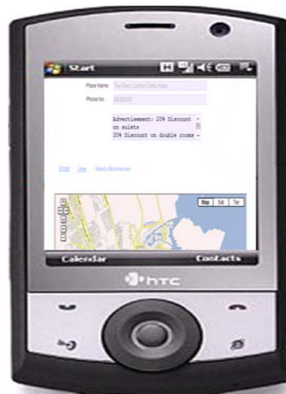
Figure 2: When the WAP link is selected on the subscriber mobile handset

It is also possible to have on-line access to the service described above via a web browser using either a personal computer (PC) or a mobile handset. In this case, a web page containing a search tool will appear to help the subscriber obtaining the desired listing information. This information contains the listing phone number, a digital map, and advertising (if provided). Through the on-line Internet access, the application also gives the subscriber a list of the nearby relevant business listings. In addition, the subscriber will have the option to send the information via an email message.