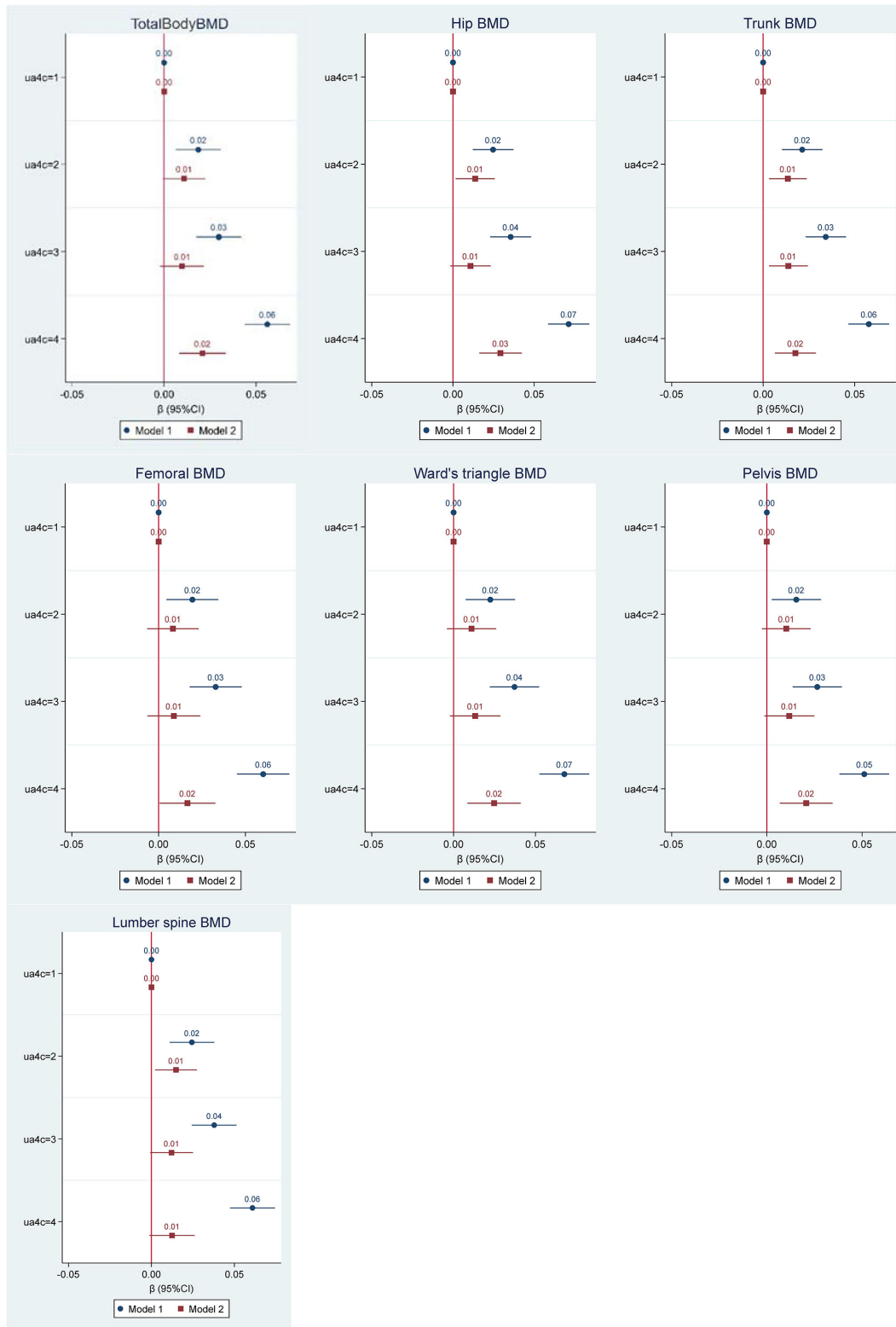
FIGURE 2 | Multiple regression analysis of the association between quartiles of serum uric acid ( \mu\text{mol/L} ) and bone mineral density (BMD) for total body and multiple skeletal locations ( \text{g/cm}^2 ). Values represent the regression coefficients per SD change of uric acid. Model 1 adjusted for age and gender. Model 2 adjusted for age, gender, BMI, serum vitamin D, Alkaline Phosphatase, eGFR, and smoking status.