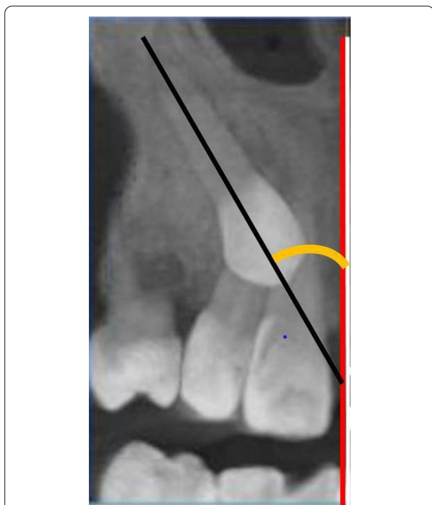
Fig. 3 CBCT image illustrating the angular measurement reference of maxillary impacted canine to the midline

lateral incisors (26.1%), the lateral incisors and first premolars (31.8%), and the central incisors, lateral incisors, and first premolars simultaneously (13.6%). The severity of resorption was highest in grade I (31.5%) and lowest in grade III (7.6%). Distributions of contact relation, location of contact, resorbed teeth and the severity of resorption between the right and left sides are presented in Table 2.