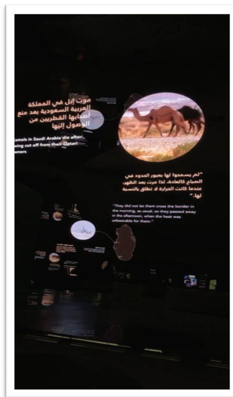
Figure 1. A digital screen displays and narrates what camel could not be endured in the middle of hot desert (Photo taken by the author NMoQ, 19 November 2019).

The NMoQ mission and vision is to develop, promote and sustain the cultural sector at the highest standards. The mottos of the museum are: Taking Museums Beyond Four Walls, Nurturing Emerging Talent and Creating a Platform for the