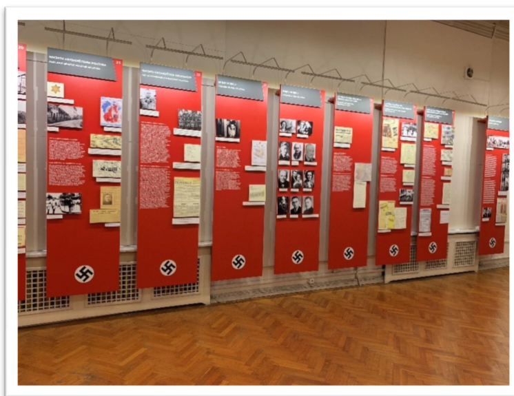
Figure 2. The presentation of the museum, which focused very much in adding various testimonies, such as people memories, individual photos, and public news (Taken by the author on October 2019).

The article showed that the museum personalized the exhibits in the sense that a long exterior wall was reserved for personal items possessed by people who had different occupation experiences as some endured, fought with partisans, perished in camps, or faced deportation (Gundega & Koknevièa, 2008) ( Figure 3 ).