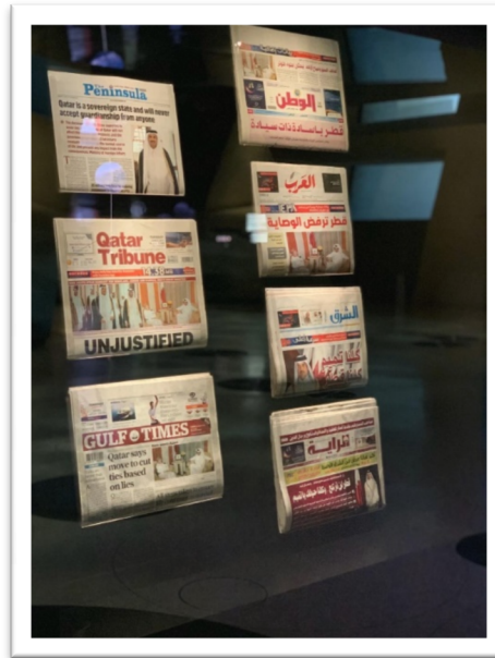
Figure 7. The intensive engagement of the media with the incident.

From within this exhibition, as a public institution, the museum plays a role in representing the community's concerns. The exhibition encompasses interaction between the local communities and governmental bodies, which regulate a guided museum presentation. The collective political incidents challenged and influenced cultural institutions in Qatar, and their practices transformed. The museum became inclusive in its collecting process and more receptive to contemporary issues. The exhibition clearly articulated the communities' reaction towards such political incident, as well as it represents the engagement of the media. The museum acted here as an official platform that documents permanently the impact of the blockade (Al-Hammadi, Exell, & El-Menshawry, 2020). The political circumstances have provided the new museum opportunity to engage with the community and develop a new political culture approach. The incident imposed the urgency of change within presentation and collection policies. Thus, the museum moved from its social responsibilities to reflect its prevailing conviction of the importance of its interaction and response to crises (Gollin, 1965).