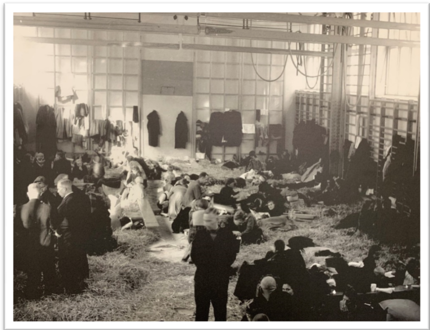
Figure 4. The Parasha Prison (Taken by the author on October 2019).