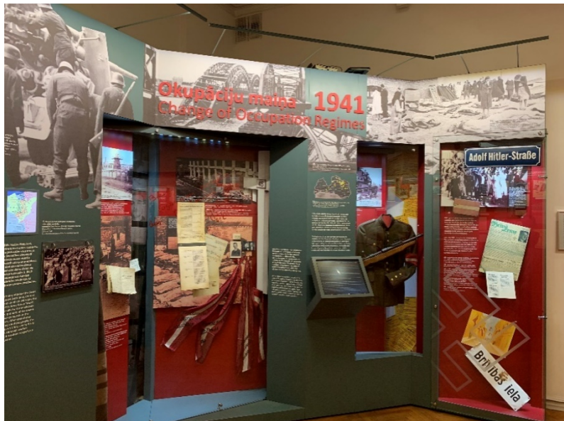
Figure 3. Change of Occupation Regimes.

The deportation survivor suggested that it had been put in barracks, cells, Stolypin’s wagons, and cattle wagons likely indicating the inhumane transportation conditions and vehicles used to this end. There being unsanitary conditions and