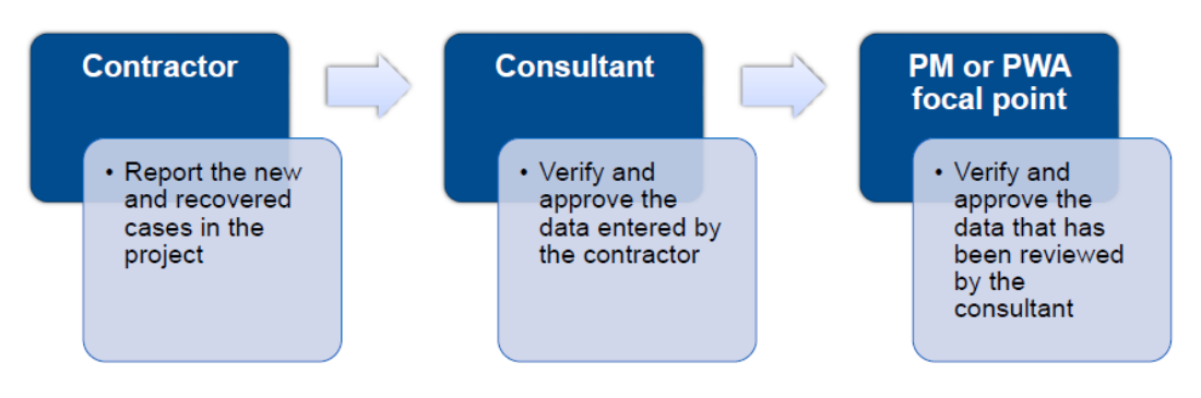
Fig. 1: COVID-19 Reporting – Workflow

The Dashboard provides the mechanism to enter COVID cases data through secured data entry form to restricted, responsible persons for each project and Ashghal office spaces. The contractor shall enter COVID related data on daily basis (if no cases to be reported, the contractor shall enter 0 as a value). Cut of time is 5 PM daily, however the system is open for reporting till midnight. The system will be sending notifications to PMs in case the contractor didn't enter any data before 5 PM daily.