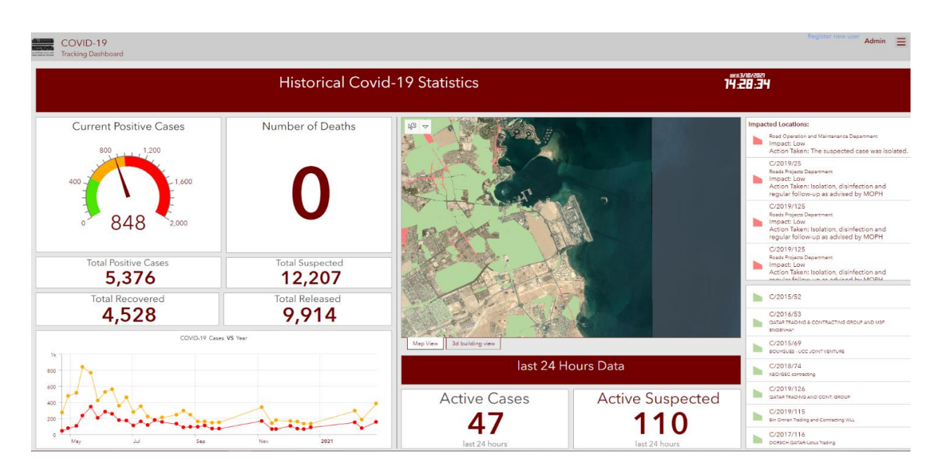
Fig. 6: Automated Online Dashboard - with Key Indicators and Summary of Cases

The Dashboard provides a visual data representation with maps reflecting all approved collected data from stage one. The COVID-19 data is analysed in real-time and presented through meaningful graphs to understand the patterns of cases. The data is also presented on the GIS Map to display the impact on Ashghal's construction or maintenance projects across Qatar. The map depicts the risk factor as – high, medium, or low in red, blue and green colour, Figure 6.