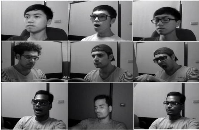
Fig. 1. NTHU Dataset Sample Images