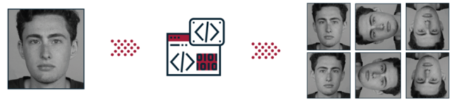
Fig. 3. Data Augmentation

As we cannot train the neural network on video data, the images need to be extracted and then fed into the model. The video specifications are at 30 frames per second. These frames are converted to images and thereby correspond to a total of around 600,000 images.