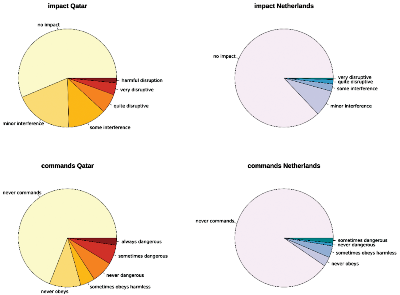
Fig. 2. Differences in characteristics of auditory hallucinations as experienced by participants from Qatar (left panels) and Netherlands (right panels). Participants from Qatar indicate that their auditory hallucinations are more impactful and more often consist of commands than participants from the Netherlands.

Dutch participants reported a younger age of onset of TH (median 13 years, IQR = 8 years) than participants from Qatar (median 17 years, IQR = 8 years) ( X^2_1 = 13.9 , P = 0.003 ).