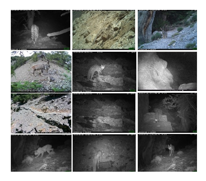
Fig. 2. Camera trap photographs of different mammals from the study area.