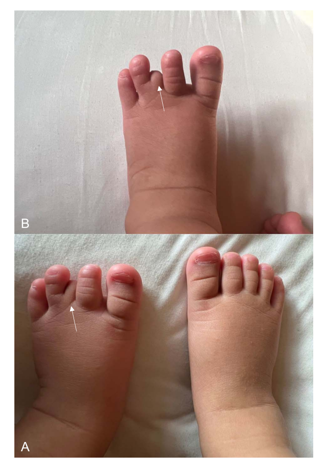
Figure 1. (A) Bilateral feet with normal right foot and left foot (arrow). (B) Hypoplastic left third toe with no visualization of the whole digit and absence of toenail (arrow).

Foot X-ray confirms hypoplastic left third toe with no visualization of middle and distal phalanges — suggesting a very rare variant of brachydactyly (type B) (Fig. 2).